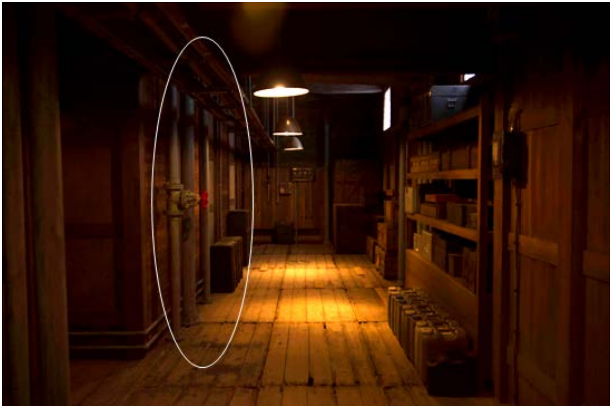
©Hideaki Sorachi/Shueisha ©2017 Movie "Gintama" Production Committee